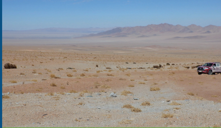
View of Block 3 Project Showing Extensive Pampa Cover

Access to the property is moderate, from Antofagasta or Taltal, from the Pan-American Highway (PAH), via a maintained dirt road that passes by the operating Guanaco mine, and then by unmaintained dirt roads to the project area